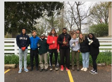
Photo: Oberlin College track team grounds volunteers, 2023.