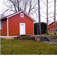
THE LITTLE RED SCHOOLHOUSE READING MAY 13, 2023 | 7:00 PM | OBERLIN, OH Poetry and performance for place and movement Submit your work to foxostrich@gmail.com No more than three poems, please Parking for Oberlin Heritage Center near the School House and Theater

On Memorial Day weekend, the Friends of Westwood Cemetery and the Oberlin Heritage Center will be hosting a table to assist cemetery visitors on locating gravesites. The table will be located inside the entrance gate of Westwood Cemetery. It will be available on May 27, 28, and 29 from 11:00 am to 3:00 pm – weather permitting.